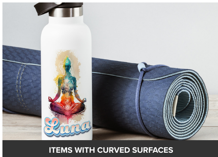
ITEMS WITH CURVED SURFACES