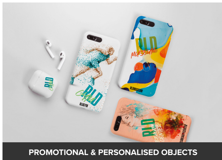
PROMOTIONAL & PERSONALISED OBJECTS