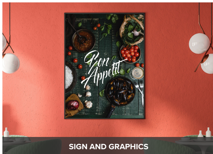
SIGN AND GRAPHICS