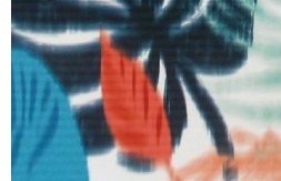
Before feed correction

The built-in colour sensor allows for automatic media feed adjustment using “Feed Master”.