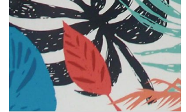
After feed correction