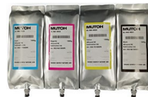
4 colours (C,M,Y,K) 1000g ink bag