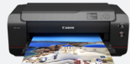
imagePROGRAF PRO Series