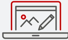
DIGITAL PHOTO PROFESSIONAL