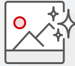
PROFESSIONAL PRINT & LAYOUT