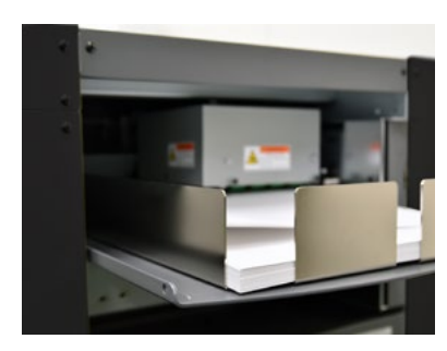
Patented Tri-suction Feeder

Cleaning and maintenance are important to keep oreal ining and maintenance and finishing quality. The AeroCut nano Max has quick-release rollers and components. Even if paper is jammed, this feature assists quick recovery.