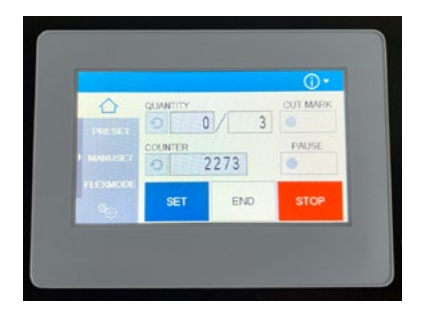
Intuitive Touch Screen UI

The unique InstaSet BAR indicates and aligns slitter positions accurately and can be easily adjusted manually without tools. Built-to-order bars are available for custom sized jobs, at lower cost compared to "slitter cartridges".