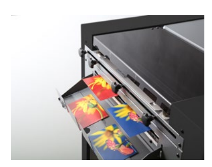
Better, Faster, Stronger

The AeroCut nano Max is now equipped with a colored touch screen with the redesigned UI. Out mark registration and Image shift & stretch compensation function help an operator to make fineadjustments to digitally printed stocks